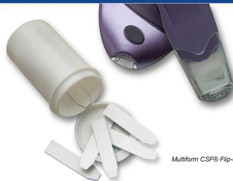
Multiform CSF® Flip-top Vial