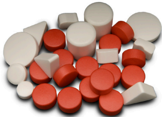
Multiform CSF® is available in a full range of colors

Multiform CSF® can serve as a Fit-In solution discretely included in your pharmaceutical or IVD device