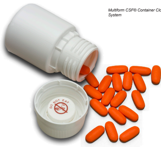
Multiform CSF® Container Closure System

Multiform CSF® is also available using our IntelliSorb moisture management formulations for a customized level of equilibrium relative humidity control (ERH), especially helpful in dry powder inhaler product applications whereby standard desiccant use may be too drying.