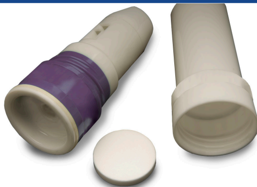
Multiform CSF® is ideal for Respiratory Drug Delivery (RDD) devices given it has a higher loading per unit volume than traditional loose-fill desiccants